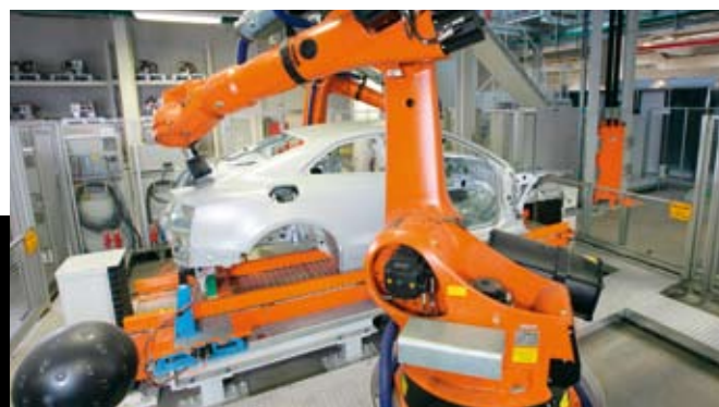
Welding, machining, removal of castings, or inline measurement of bodies-in-white: these are only a fraction of the possible applications.

KUKA offers you a comprehensive range of software: from ready-made application software for the most common applications to simulation programs for planning robot cells and Safe Robot Technology for monitoring safety zones. And for precisely coordinated teamwork with several robots, we offer the RoboTeam application package. The advantages: maximum scope and maximum safety.