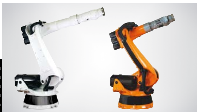
Be it the standard variant, with optional arm extension, or the cleanroom or foundry variant – the 2000 Series offers the right solution for every requirement.

Cost-effectiveness was a major priority right from the design phase of the 2000 Series: state-of-the-art engineering, as in the gear units with the highest torque in their class, guarantees 40,000 hours of continuous operation. Moreover, wear-resistant components, such as robot wrists with beltless spur gears, extend maintenance intervals – and cut costs. The advantages: trouble-free production and greater planning security.